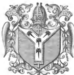
Arms of the Archbishopric.