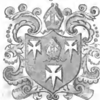
Arms of the Bishoprick.